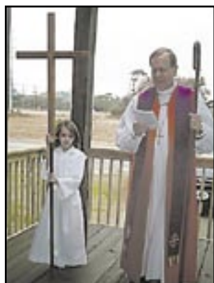
Anglican movement comes to the Banks. Page B1